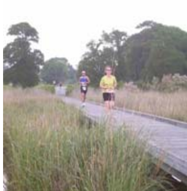
Runners Cross Marsh Boardwalk