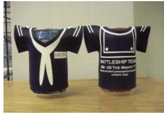
Sailor Shirt Koozies Are Just Waiting For You!

This week's special at the BB35 Park Store is a sailor shirt koozie! This clever little ditty is designed especially for the bottle consumer, but it can be used for cans (as shown). Its asking price is only $4.99 each, and if you're looking for a conversation piece that's sure to be the life of the party, pick up a few of these and give them a try. Not responsible for failure to be life of the party due to lack of social skills, or overindulgence of certain beverages consumed. Please read warning label if driving or operating heavy machinery.