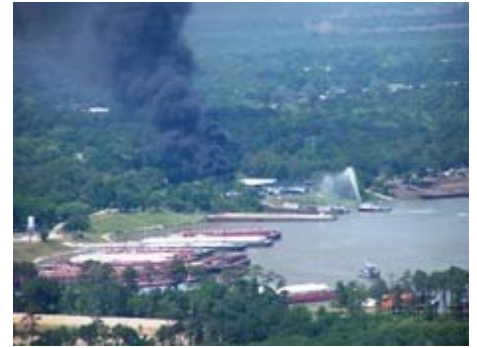
Smoke Rises Just North Of The Battleship BB35 Almost Seems Afire In Close-Up! Fire Boats (R) Spraying From Off Shore