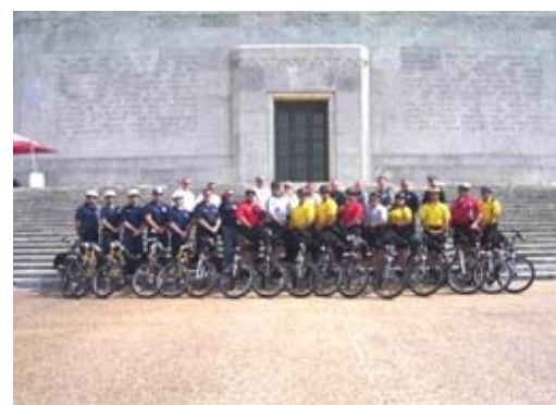
La Porte EMS & Fire Department Bike Teams Along With Guests With A Friendswood Team