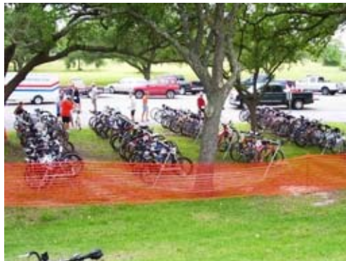
East Monument Circle Is Bicycle Corral