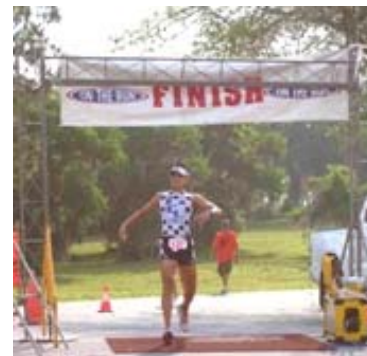
Runner Crosses The Finish Line